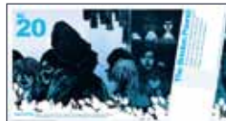
Reverse of notes