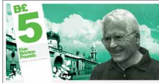
B£5 with James Lovelock