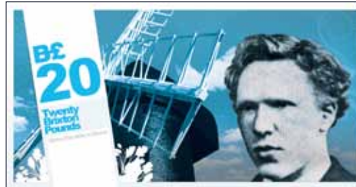
B£20 with Vincent Van Gogh